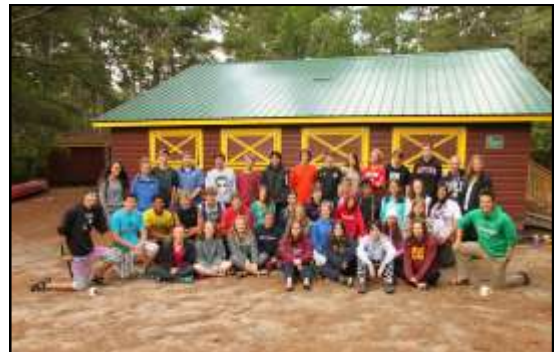
Greenway Leadership participants - 2014

The Norquay program has two options that participants can choose— the extended canoe trip option and the in-camp program option. The River Canoe Trip option features a 35 day long canoe trip along one of our northern Ontario rivers. Both options experience all the leadership requirements of canoe and kayak trips.