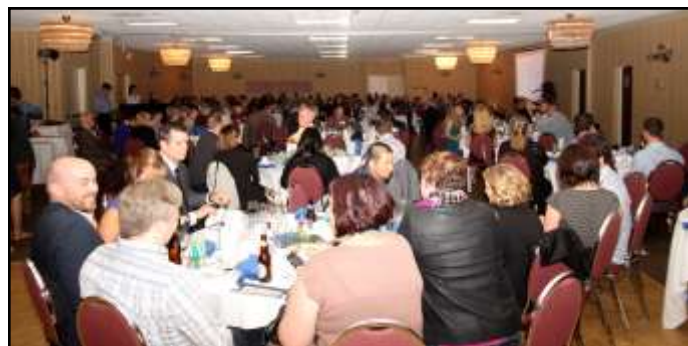
Participants enjoying dinner at the 60th Anniversary

Your comments about the anniversary are welcome. See the back page for info.