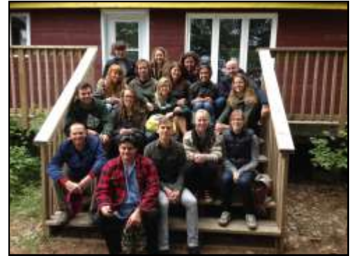
A group of alumni renewing their JIC connection

As alumni and their families munched on sandwiches and snacks in the dining hall, staff and campers from all six decades that the camp has operated shared stories and experiences. As the day came to a close and good-byes were heard on the trails and at the docks, one common thread became very evident amongst alumni of all ages - the experiences that were gained at John Island had a major influence on their life that will never be forgotten. It is truly a “magical place” .