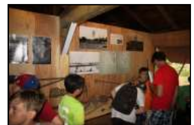
Campers explore the museum

In phone calls to the camp this summer, the museum requested information and photos that we might be able to share with them so they could set up a display of the long lost brothers and their ill fated lumber mill. The camp has a significant collection of photos and information about the brothers, their ancestors, and the mill which they brought to John Island. We now have a display of this part of John Island’s past in the new camp Museum which is located in the renovated craft shop.