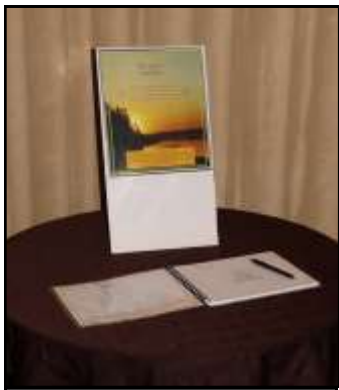
Memory Book on display at 60th

A book to remember those who have passed on and who have made a significant impact in the lives of others and the camp was unveiled at the 60th Anniversary dinner. There have been many individuals who we wish to remember for their contribution to camp and to the lives of others. The book will be kept in the new museum in the renovated craft shop at John Island.