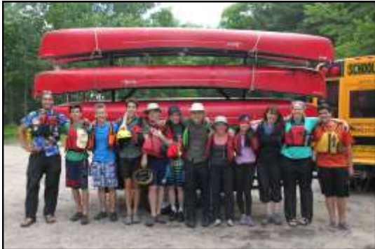
Norquay 'B' group about to depart on their 35 day Missinaibi River canoe trip.

With camp barely closed for the 2014 season, registration for leadership programs at John Island for 2015 have been brisk with some programs filled. The programs have been very popular in recent years requiring an earlier registration start date to help accommodate those wishing to attend. John Island continues to be recognized for its leadership programs which now comprise a high percentage of all camper registrations.