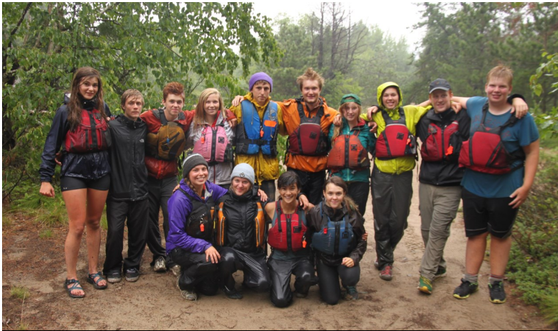
2013 Norquay |River Group Returning from Missinaibi Trip

play guitar at the campfire for the first time as a Norquay would go a long way in me gaining confidence as a musician moving forward. Looking back on it, the welcoming environment that the camp was able to provide for me as a young teenager through the Norquay program was exactly what I needed.