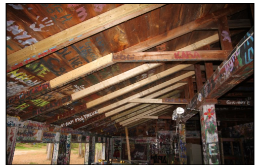
Craft Shop before the renovations began