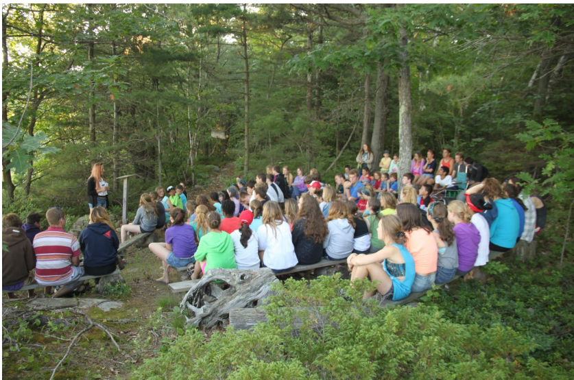
“Reflections” service in the John Island chapel in 2013

At camp, we are with persons who have an established or evolving value system that radiates through their daily lifestyle. The role-modeling by staff is powerful. The values that are part of our camp life at John Island are important as we all get to witness the values in practice and the effect of these values in our daily life....and the life of others.