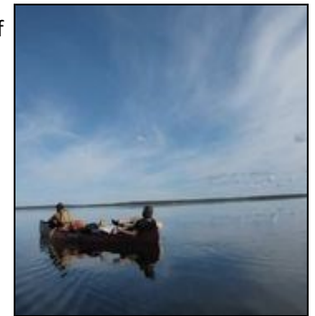
Northern rivers provide for never ending beauty