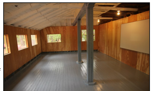
Renovations complete as a new Leadership Centre takes shape