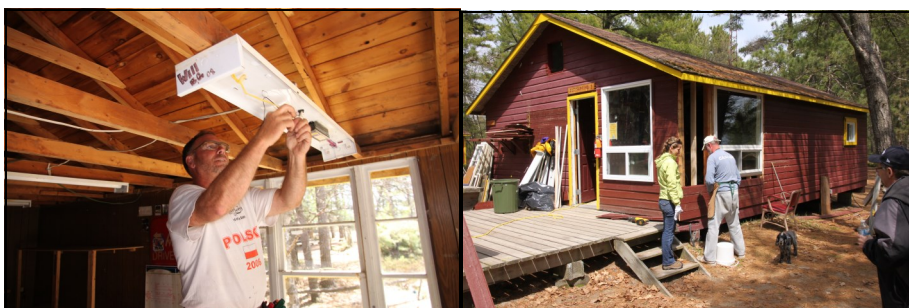
Ken Brims removing old light fixtures in the out-trip shed and AI Will discussing the installation of new windows in building.