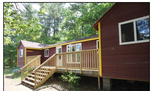
Newly rebuilt cabin