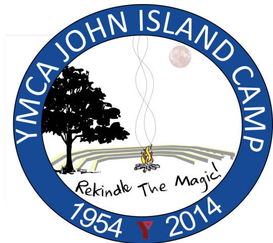
This 60th Anniversary Reunion Logo

While the Saturday evening party at the Howard Johnson is an event for those 19 years and over, the visit to