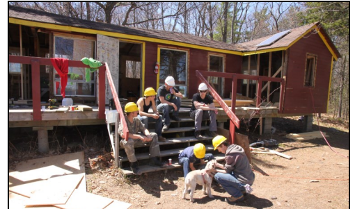
Senior Cabin (Eagle-Talon) as rebuild starts with students from Lasalle Secondary

Thanks to all volunteers and spring camp staff who worked diligently on all of these projects as we continue to improve the camp facilities.