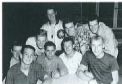
1954 1st Boy's Camp Counselors