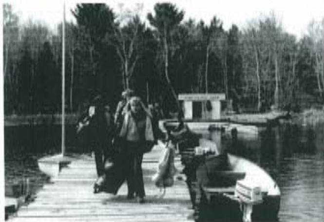
Leaving Spring Camp 70's

Tout la meme bateau as we chugged and chopped our way across the channel to the calmer waters of Moiles Harbour and our final destination, John Island. The old sawmill road that leads us to the main site of camp is a passage through time. Berry bushes and brambles amongst rustling shrubs and colourful wildflowers entwine their bodies around the old sawmill foundations, which are blanketed by moss and lichen. Numerous relics, antiquated by time and exposed to the northern wilderness serve as a reminder of a