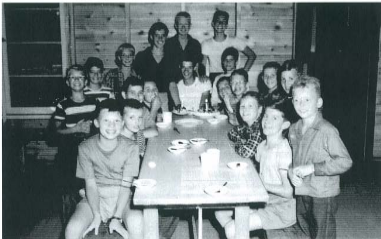
1954-55 can you find yourself in this picture? Let us know

Send names to: YMCA John Island Camp 140 Durham Street Sudbury, ON P3E 3M7 or email: camp@sudbury.ymca.ca